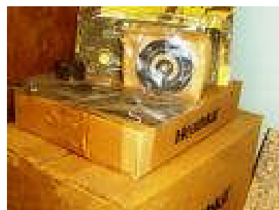
Unopened Heathkit HW-9 QRP CW transceiver in a display case at ARRL HQ.

"Next on the market will be a Wireless Swimming Pool Monitor kit followed by many more. Heathkit wants to continue to bring to its customers interesting, unique Heathkit products. Heathkit is interested in learning what types of products kit builders would like to build. Kit builders can submit their suggestions through this website using the Contact Us email."