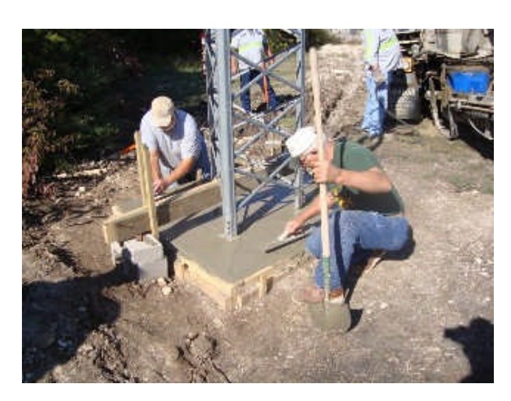
More photos at <a href="http://www.txvhffm.org/photos.shtml">http://www.txvhffm.org/photos.shtml</a> (Written by Larry Essary, K5XG)